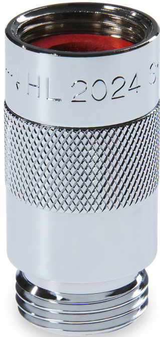
Top left: HL2024 Shower