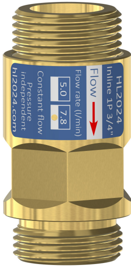
Figure number: 1140