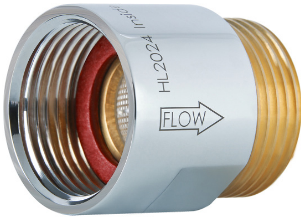
Top left: HL2024 Connect