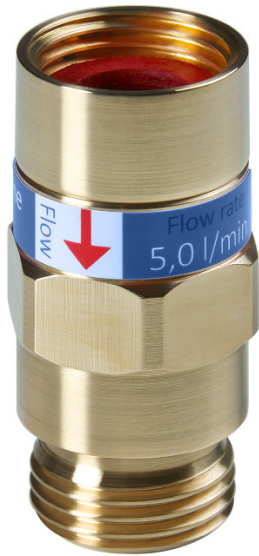
Top left: HL2024 Inline 1P 1/2" f-m