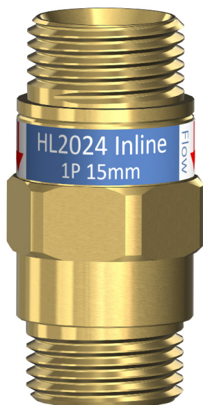
Figure number: 1140